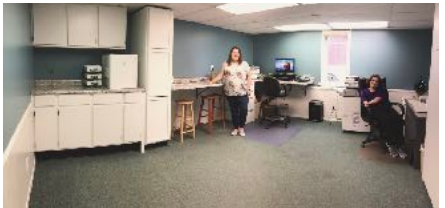
Our current offices have begun to undergo a much needed “facelift”

We were astounded by God’s goodness through your giving just one year ago when we opened up this campaign. Within a few short weeks, the funding for the first two phases of this project was in place. Today we can report that the current building has a new metal roof and the whole property has a new septic system. At the same time the septic was installed, the site work was done for the new building!