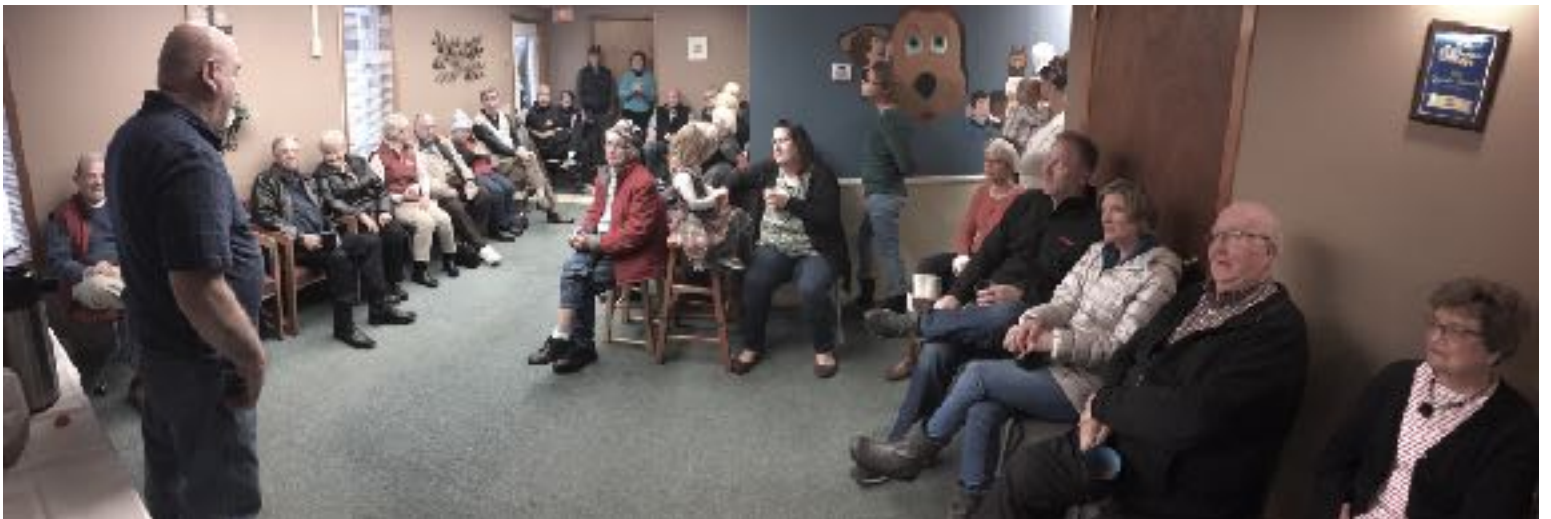
This fall we hosted a couple of tours of our facility